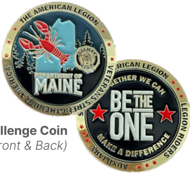
Challenge Coin (Front & Back)