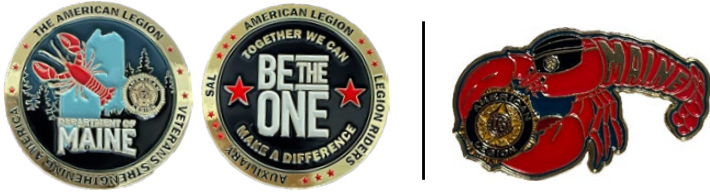
Maine American Legion BE THE ONE Challenge Coin, left, and Maine American Legion Lobster Lapel Pin, right.

Coins and pins are $10 each plus $5 shipping/handling. Coins and pins are also available for FREE PICKUP at Department HQ. For more information, please call Department HQ at 207-873-3229.