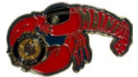
Maine American Legion BE THE ONE Challenge Coin, left, and Maine American Legion Lobster Lapel Pin, right.