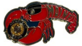
Maine American Legion BE THE ONE Challenge Coin, left, and Maine American Legion Lobster Lapel Pin, right.