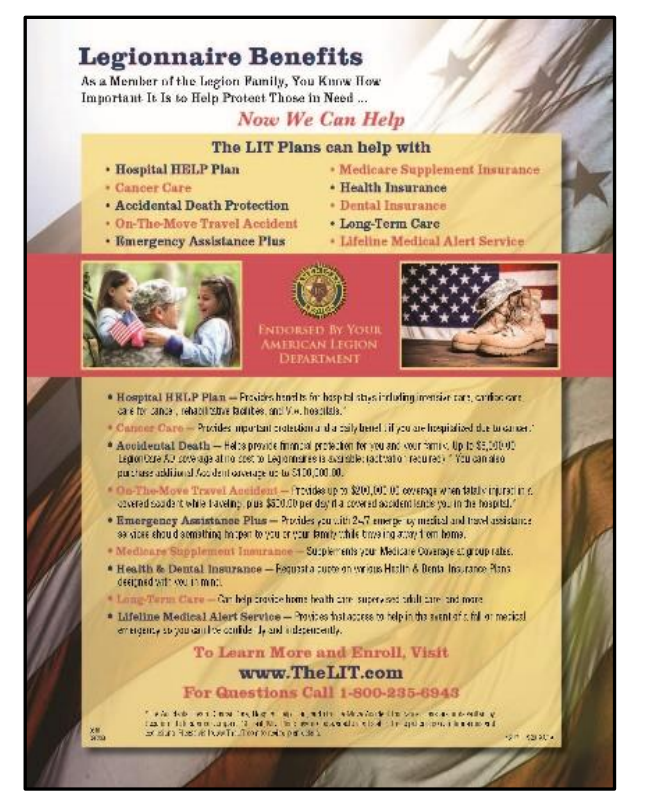
Click flyer below to view Legionnaire Benefits or visit http://www.mainelegion.org/media/misc/LIT_All_Prod ucts_Flyer_(003).pdf

For more information, visit <u>www.theLit.com</u> or call 1-800-235-6943.