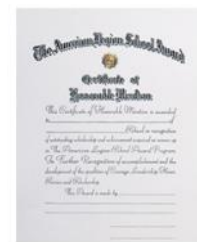
Honorable Mention Certificate