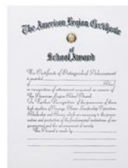
School Award Certificate