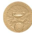
Medallion Lapel Pin