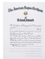
School Award Certificate