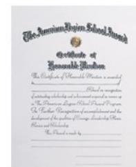
Honorable Mention Certificate