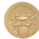
Medallion Lapel Pin