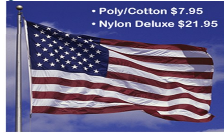
Outdoor Flags 3' x 5'

★ MEMORIAL DAY ★ is just around the corner!