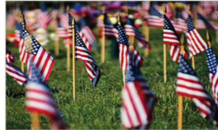
Gravemarker Flags as low as 56¢ each