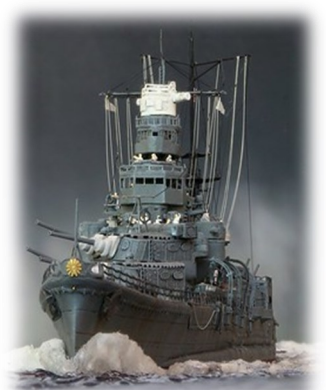
Japanese heavy cruiser Kinugasa at Battle of Savo Island

A: On August 9, 1942, ships of the Japanese Imperial Navy surrounded the Island & began the first major Battle of Guadalcanal. Within 1 hour, the Japanese had caused major damage to or sunk many ships, including the USS Chicago, the HMAS Canberra, the USS Astoria, the USS Vincennes & the USS Quincy. They used the “ Long Lance ” torpedo, the first torpedo ever to have a gyroscope guidance system & since it weighed over 6000lbs., only one was needed to cut a destroyer in half.