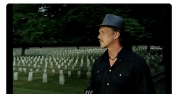
Trace Adkins - Arlington

Click on the link below to watch Country singer Trace Adkins perform "Arlington".